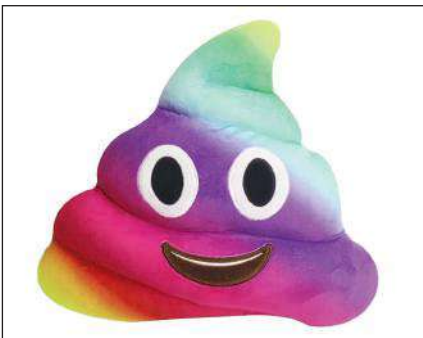
Emoticon pillow - unsafe

by the BTHA that has revealed that of 100 test purchases from Amazon, eBay and AliExpress, which it is estimated facilitate more than 90% of sales through online marketplaces in the UK2: 86% of the toys were noncompliant with UK safety requirements and 60% were assessed as unsafe for use.