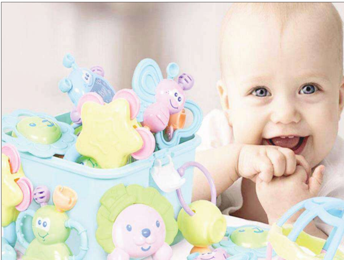
Unsafe teething ring mobile for baby boys and girls