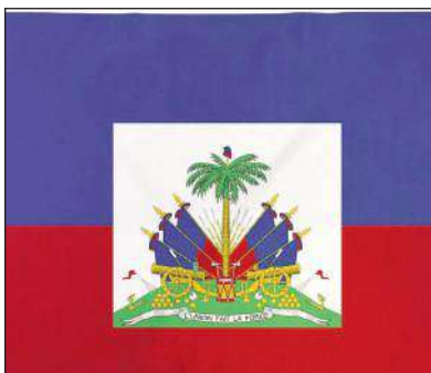
Flag of Haiti