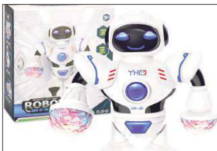
Dancing robot - unsafe