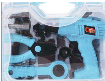
Kids tool kit - unsafe