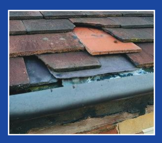
Alert over dodgy roofers - P6-7