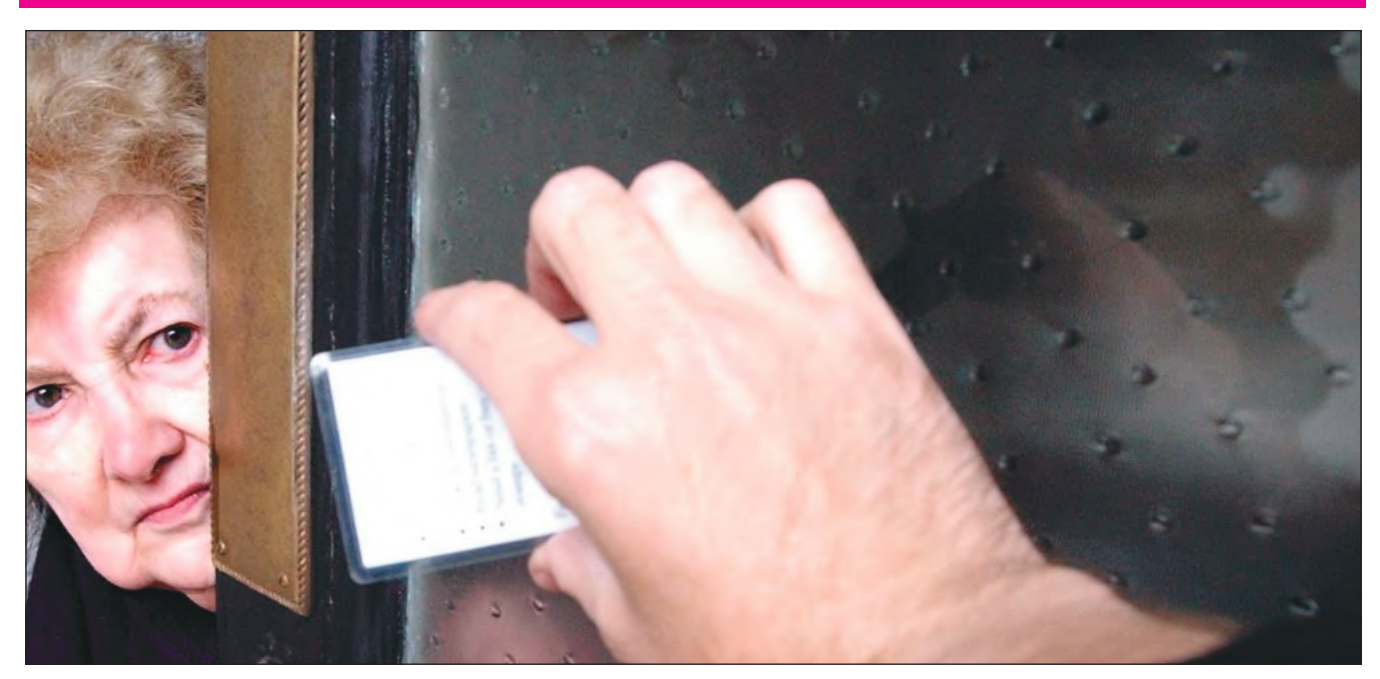
Doorstep crooks can trick you into parting with thousands of pounds so stay alert