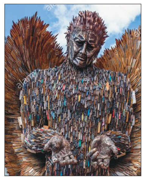
Knife Angel statue

The visit to the city has been organised by youth organisation Keep It 100 Essex with the