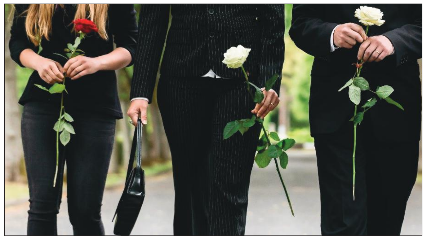
Undertakers being investigated over the lack of transparency over the cost of funerals

FUNERAL directors have reluctantly become wealthier due to the high number of deaths caused by the pandemic.