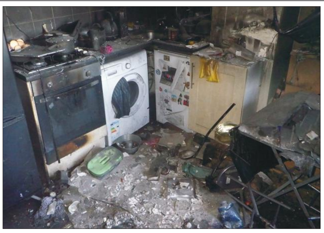
The damage caused to one flat after a scooter caught fire while being charged in a bedroom

Lastly, never block your escape route with anything, including bikes and scooters. Store them somewhere away from a main through route.